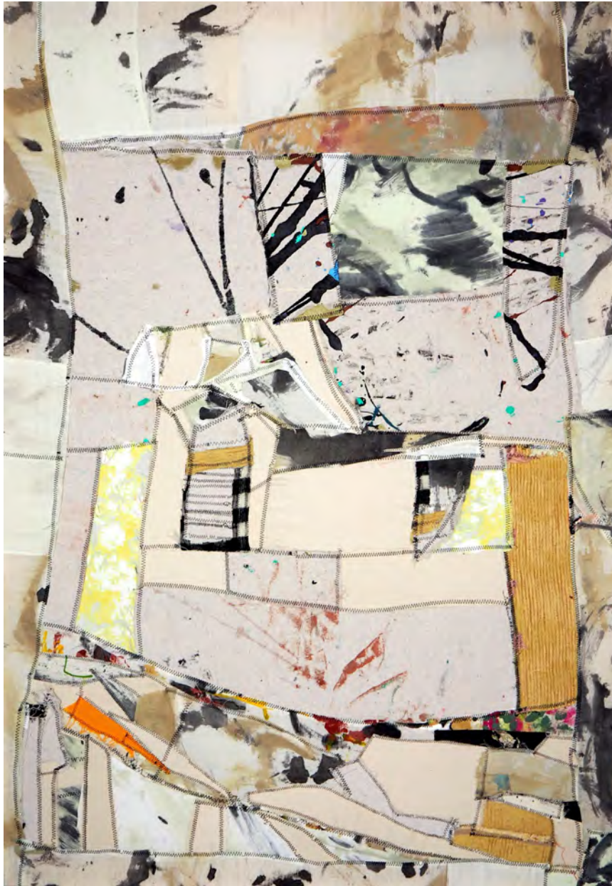
Heather Bause Rubinstein It's a subway day (plots) , 2019 pigment on material, stitched 44 x 30 inches (HBa-2) $5,000