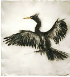
John Alexander Anhinga Two , 2007 Charcoal and watercolor on paper 27 1/4 x 27 3/4 inches 69.2 x 70.5 cm