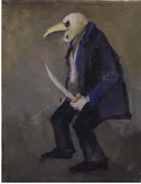
John Alexander Don't Laugh at My Mighty Sword , 2008 Oil on canvas 13.75 x 10.75 inches 34.9 x 27.3 cm