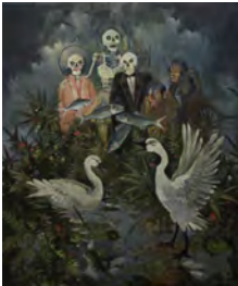
John Alexander Issues , 2008 Oil on canvas 60 x 50 inches 152.4 x 127 cm