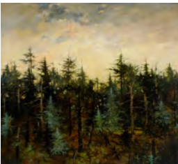
John Alexander Lost America , 2008 Oil on canvas 64 x 72 inches 162.6 x 182.9 cm