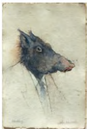
John Alexander Warthog, 2007 Pencil and watercolor on paper 11 7/8 x 9 inches 30.2 x 22.9 cm