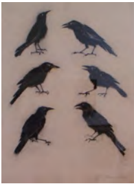
John Alexander Various Forms of Passive Aggressive Behavior , 2007 Charcoal on paper 30 x 22 1/4 inches 76.2 x 56.5 cm