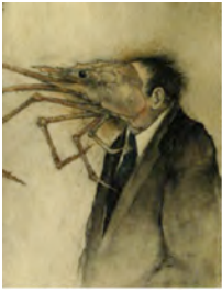
John Alexander Shrimthead , 2007 Charcoal and watercolor on paper 27 x 27 3/4 inches 68.6 x 70.5 cm