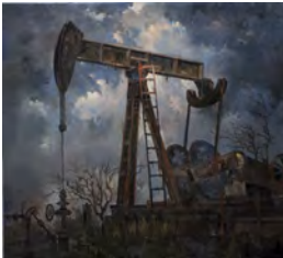
John Alexander Big Oil , 2008 Oil on canvas 76 x 84 inches 193 x 213.4 cm