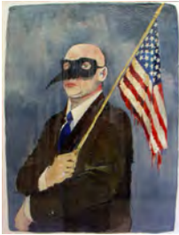
John Alexander Pinhead , 2008 Oil on paper 30.75 x 23.25 inches 78.1 x 59.1 cm