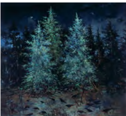
John Alexander Midnight Feast , 2005 Oil on canvas 64 x 72 inches 162.6 x 182.9 cm