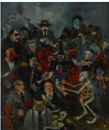
John Alexander Heroes Come and Heroes Go , 2008 Oil on canvas 70 x 60 inches 177.8 x 152.4 cm