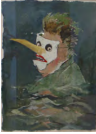
John Alexander Sink or Swim , 2007 Oil on paper 16 1/2 x 12 inches 41.9 x 30.5 cm