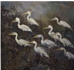
John Alexander Walking to New Orleans, 2008 Oil on canvas 60 x 64 inches 152.4 x 162.6 cm