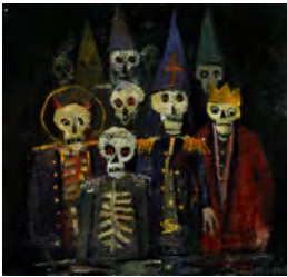
John Alexander Class Reunion , 2008 Oil on paper 10 x 10 inches 25.4 x 25.4 cm