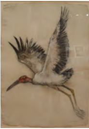
John Alexander Babymaker , 2007 Charcoal and watercolor on paper 42 7/8 x 29 1/8 inches 108.9 x 74 cm