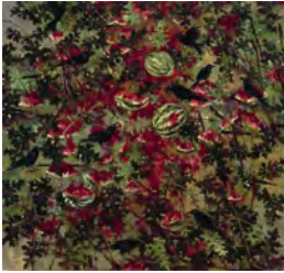
John Alexander Nevermore , 2007 Oil on canvas 68 x 64 inches