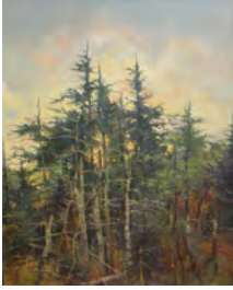
John Alexander Little Lost America , 2008 Oil on canvas 42 x 34 inches 106.7 x 86.4 cm On verso