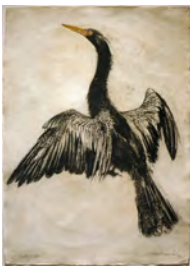
John Alexander Anhinga , 2008 Charcoal and watercolor on paper 30 x 21 3/4 inches 76.2 x 55.2 cm