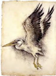
John Alexander Pelican in Flight , 2007 Charcoal and watercolor on paper 40 x 29 3/4 inches 101.6 x 75.6 cm