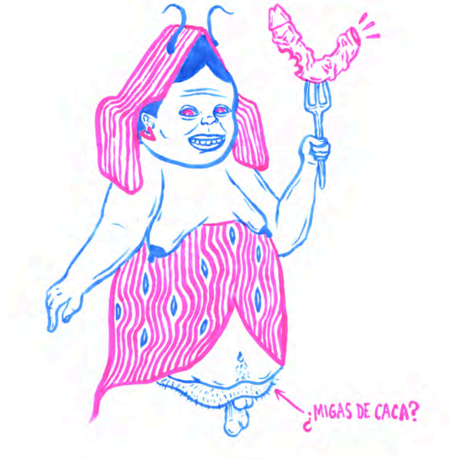
Dorian Wood, "Drawing 43" (2021–23), ink on paper, 12 x 9 inches