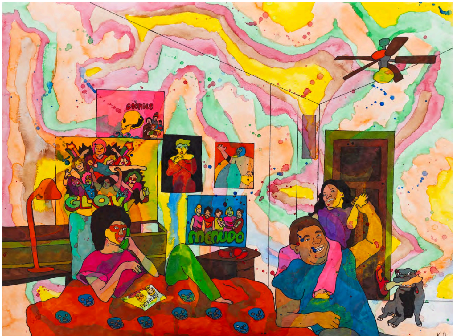
Karla Diaz, "Lucha in my room" (2022), watercolor and ink on paper, 15 x 20 inches

Just as LA celebrates its annual fair week, the pinnacle of the commercial art ecosystem, several shows across the city take a different approach, offering alternative creative visions and celebrating the abject, the margins, the forgotten. Dorian Wood turns the daily stream of injustices and inequalities into ghoulish delights, while Raul Baltazar sends up colonizers with a bit of Indigenous Mesoamerican inspiration. Queerteñx champions all types of borders, while Boundless/Binding highlights female artists from Southwest Asia and North Africa reflecting social change. Jennifer West's analog film works bring a punk, experimental edge to cinema, and a solo show of drawings by Dorothy Hood aims to restore her legacy.