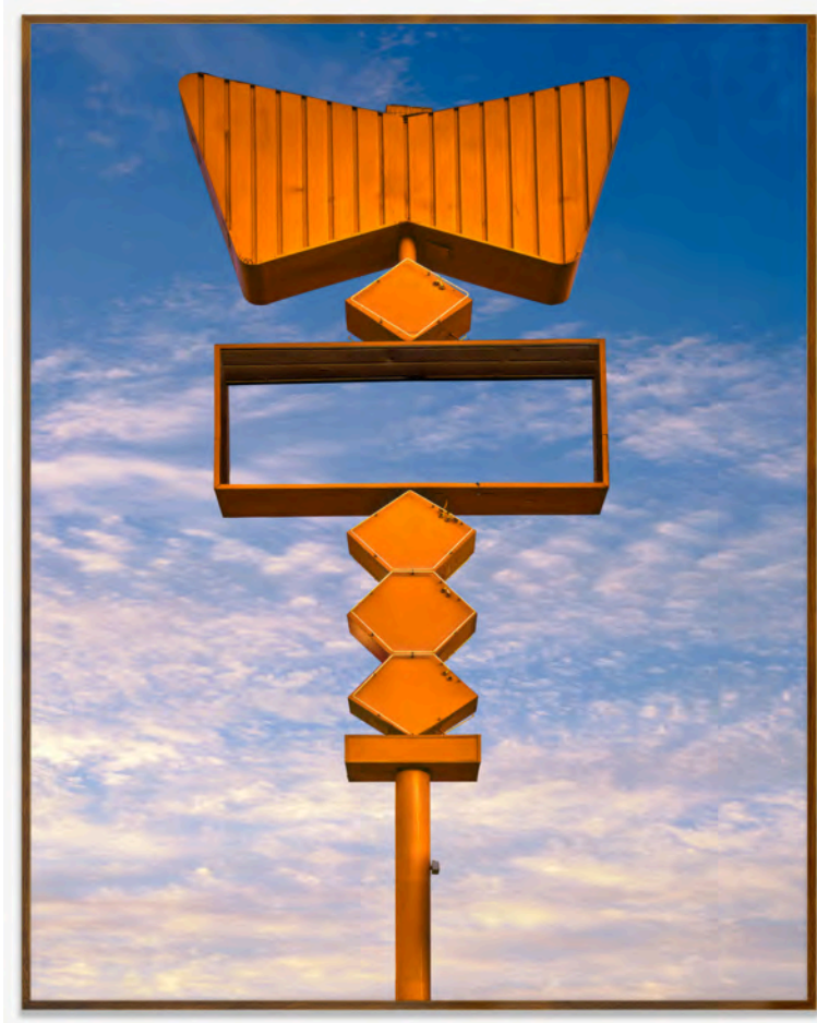
Amir Zaki, "The Collector" (2023), framed archival photograph, 60 x 48 inches, edition 1 of 2 (©Amir Zaki; image courtesy Diane Rosenstein Gallery)