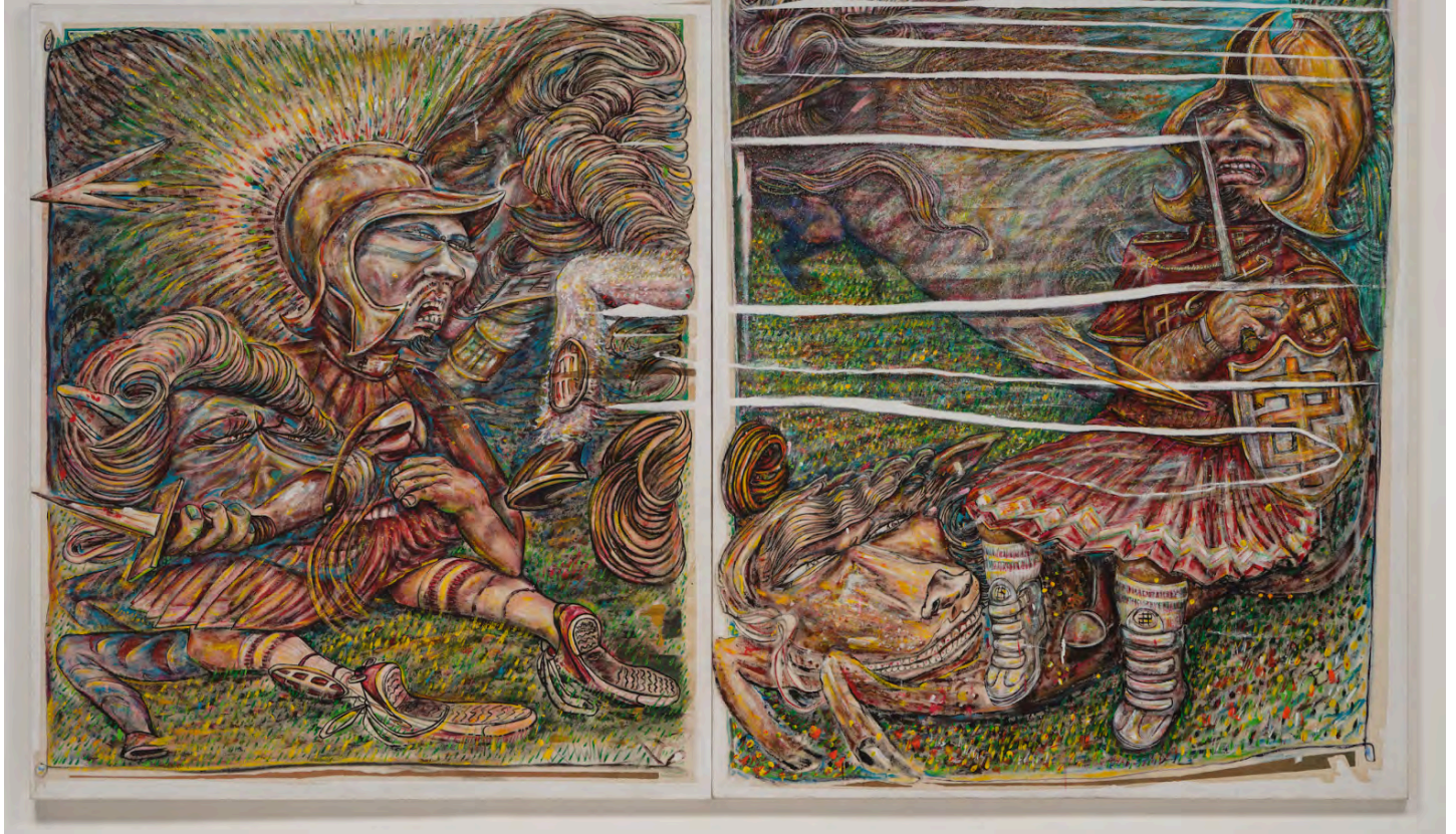
Raul Baltazar, "Huitzilopochtli (Sun God at war with stars and moon to protect his mother Coatlicue)" (2020), acrylic on canvas, 70 x 109 inches