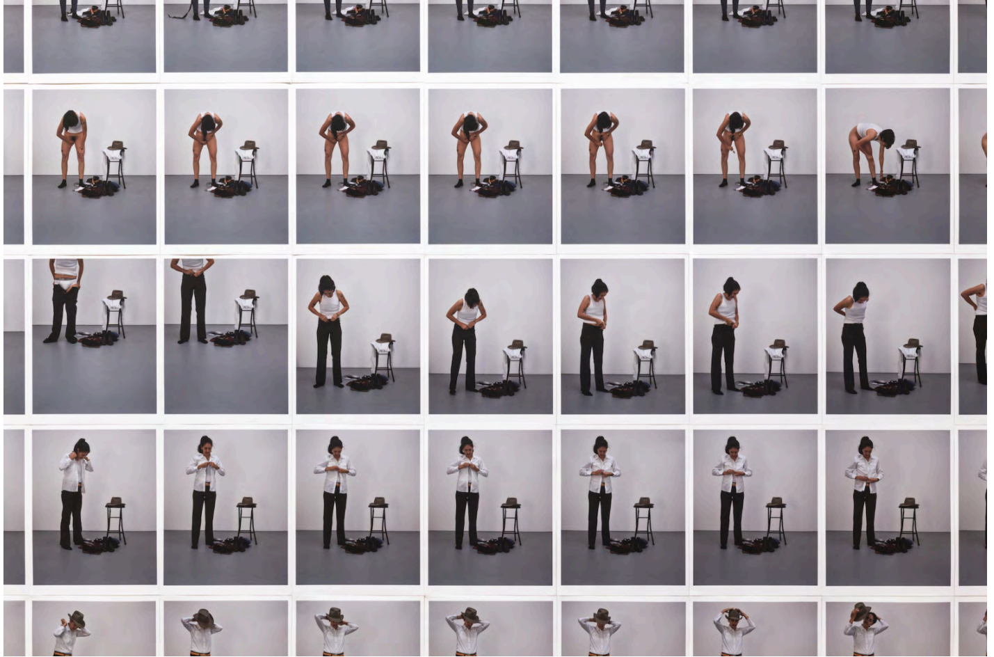
Detail of Salvador del Torre, "Siempre fui el" (2019), 189 consecutive digital photographs, archival footage of performance photographed by William Camargo (photo by Ruben Diaz, courtesy Laband Art Gallery)