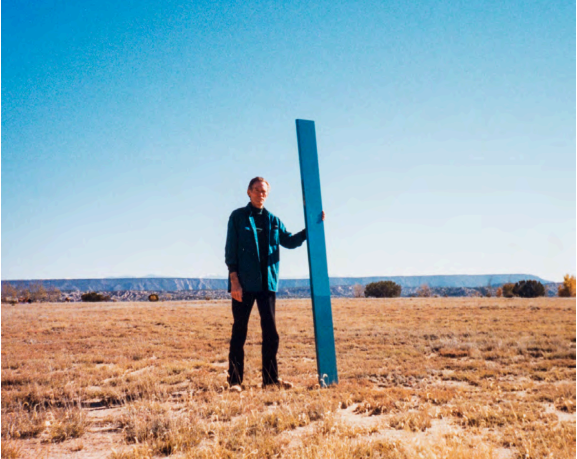
John McCracken near his studio in New Mexico in 1996