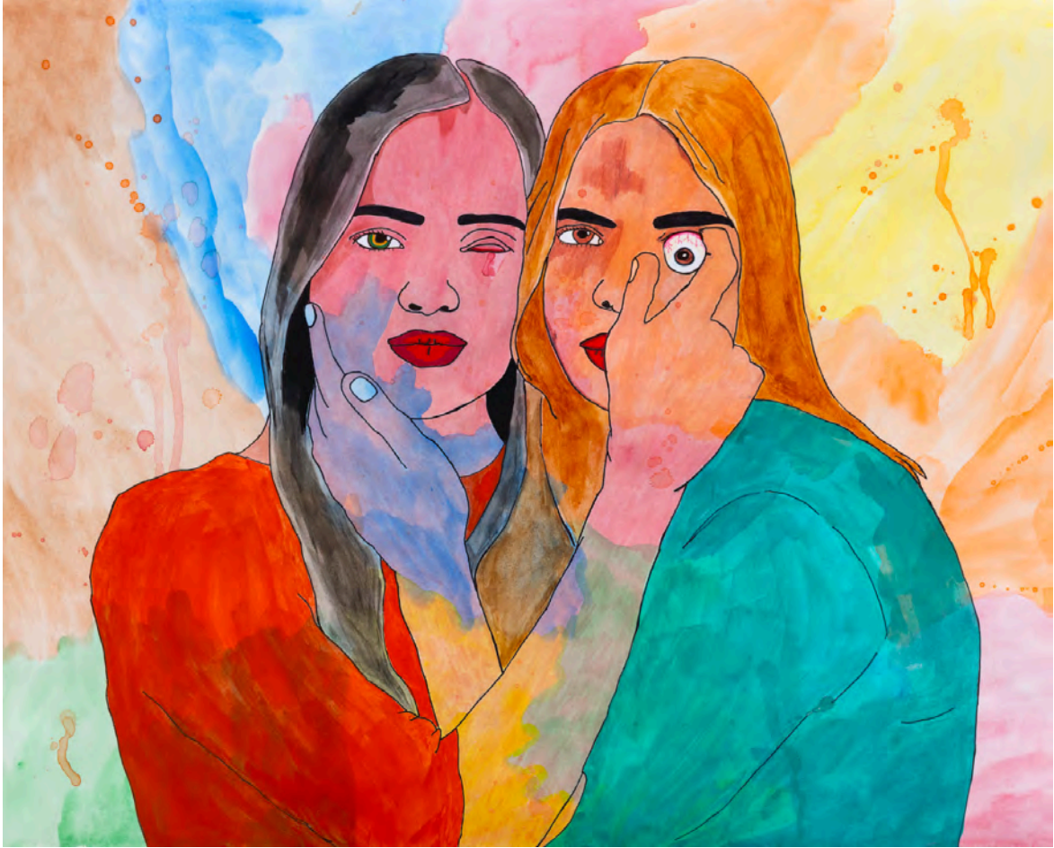
Karla Diaz, "Mal Ojo (Evil Eye)" (2021), watercolor and ink on paper, 18 x 24 inches