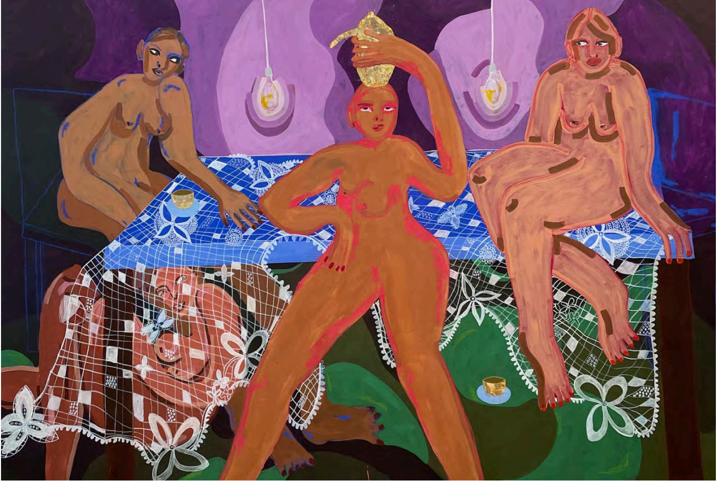
Mays AlMoosawi, "A Living Performance" (2023), acrylic on canvas, 60 x 89 inches