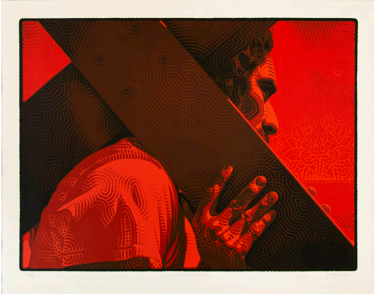
El Mac, "El Obrero" (2023), 11 color serigraph, 33 x 26 inches (courtesy the artist and Residency Art Gallery)