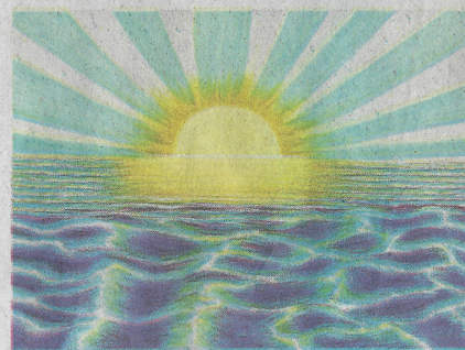
Works included in "The Voice of Water" exhibition by artist Ping Zheng include, clockwise from top left, "The Heat of the Day," "Maze," "Infinity" and "Strange Time, A Strange Dream."