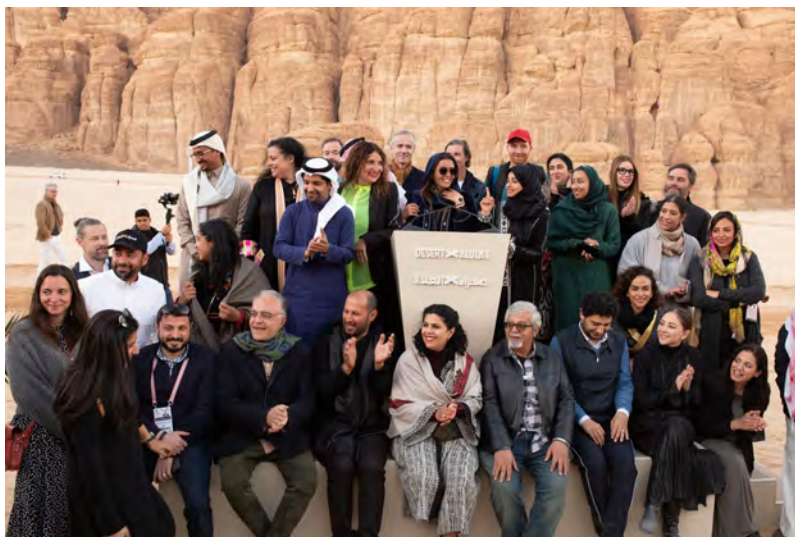
Artists, curators and organizers at the opening of Desert X AlUla, funded by the Saudi government.

For the Saudis, the benefits were clear. Until recently, many Saudis avoided the rock-hewn pre-Islamic tombs at Al Ula out of a pious superstition that they were haunted, and non-Muslim tourists who wanted to visit the country almost never found a way in. Now, in Crown Prince Mohammed bin Salman’s drive to open Saudi society and expand its economy beyond oil, Al Ula is to be reincarnated as the kingdom’s star cultural and heritage attraction. Officials hope its miles of breathtaking desert and Petra-esque ancient tombs will draw 2 million tourists by 2035.