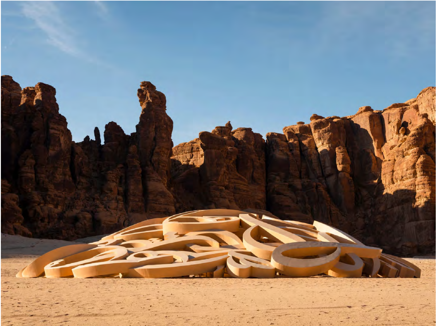
The French artist eL Seed created “Mirage” as a bridge between East and West, using Arabic calligraphy to spread messages of peace and unity. Artists Rights Society (ARS), New York/ADAGP, Paris; eL Seed and Desert X AlUla; Lance Gerber

At the opening of Desert X, the talk was a heady cocktail of erasing boundaries, breaking down walls and bridging gaps.