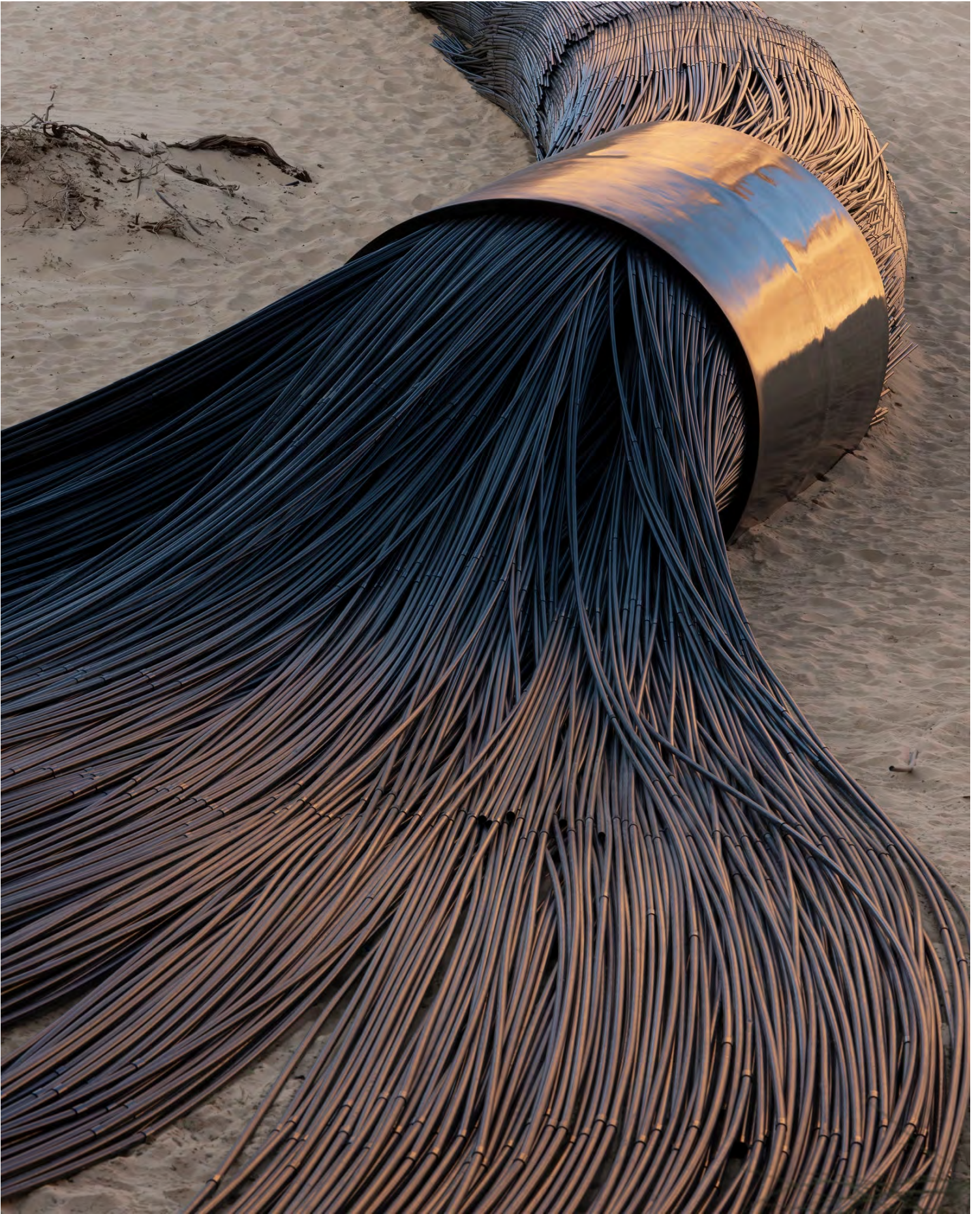
A detail of "The Lost Path," by the Saudi artist Muhanad Shono, which comprises 65,000 black pipes bound together. Muhanad Shono, Athr Gallery and Desert X AlUla; Lance Gerber