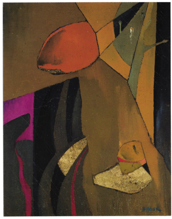
Dorothy Hood, "Unitiled (Abstraction)" (1950s), oil and sand on canvas, 24 x 18.75 inches (on loan from AMST)