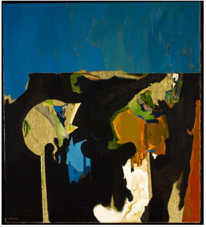
Do rothy\ Hood, "Untitled"\ (1950s), oil\ and\ sand\ on\ canvas, 44.875\ x\ 39.875\ inches\ (on\ loan\ from\ AMST)