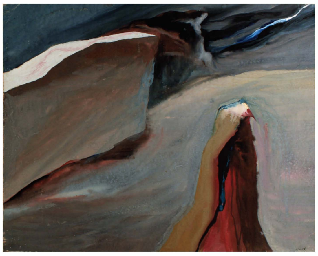
Dorothy Hood, "Untitled (Wall)" (1943), gouache on paper mounted on linen covered board, 10.625 x 13.5 inches (on loan from AMST)

husband in an old roadster," author and curator Susie Kalil describes in her Dorothy Hood monograph, The Color of Being/El Color del Ser (2016). "They lived by chance and their wits, eating canned goods, and camping under the stars."