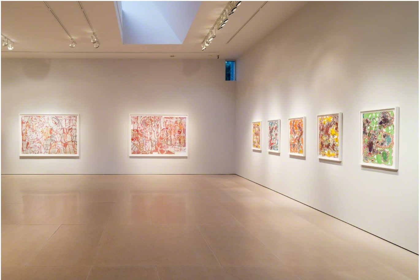
Installation view " Souvenirs from Nowhere " at McClain Gallery.

This fall, the California-bred, New York-based artist brings his delicate lines and large-scale works to Houston’s McClain Gallery in “Souvenirs from Nowhere.” The show contains both the artist’s signature collage