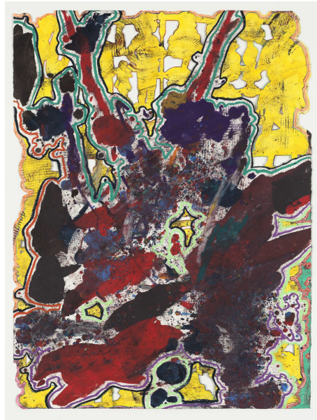
Bo Joseph Experiments in Expiration: Obliquity , 2015 McClain Gallery