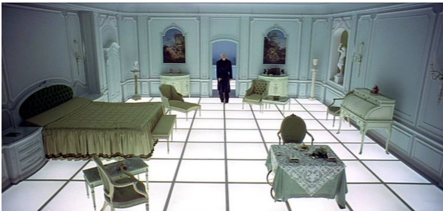
still from 2001: A Space Odyssey