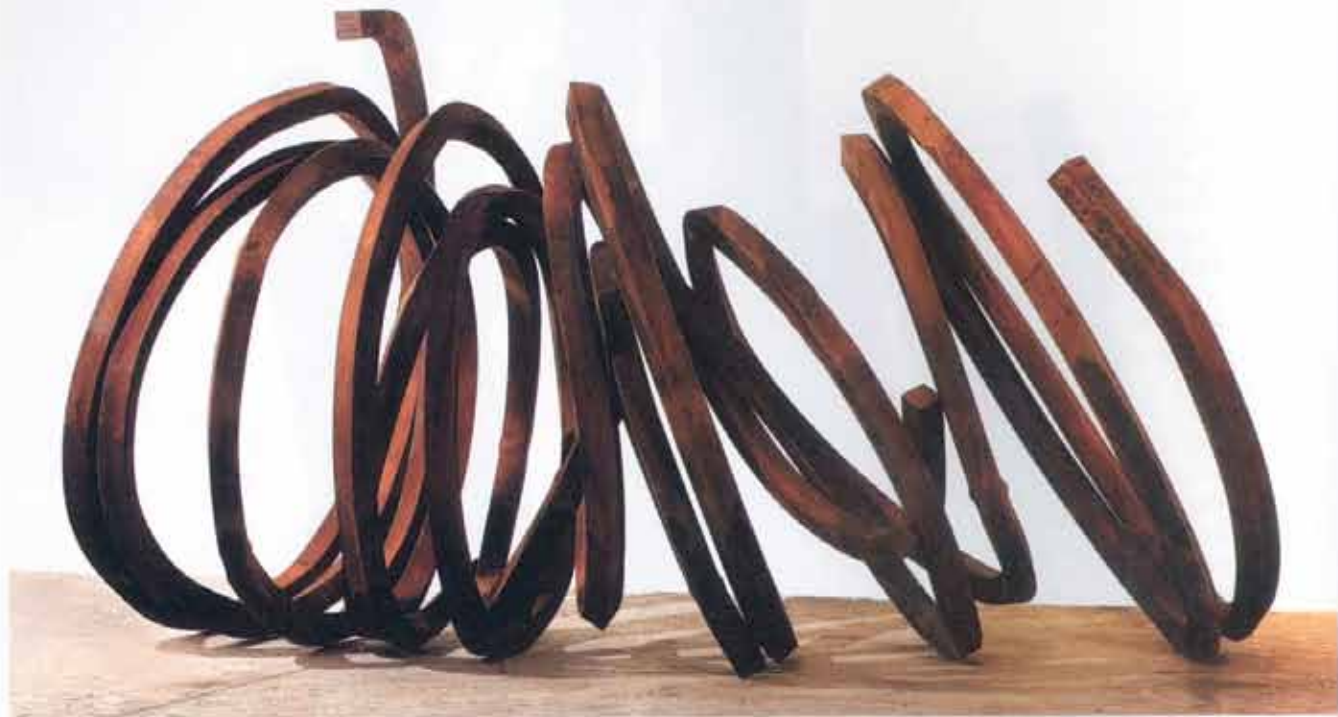
Above: Three Indeterminate Lines , 2003. Rolled steel, 104 x 102 x 173 in. Opposite, top: "Arc Installation" for the Robert Millery Gallery, New York, 2004. Rolled steel, approx. 10 x 18 x 18 ft. Bottom: 13 Arcs , 2004. Rolled steel, 7 x 21 x 6 ft.

how difficult it is to cold-twist steel bars that measure 4.5 inches in section. One then understands the danger and the physical effort. At each instant it is necessary to find improvised solutions so that I can attain the desired goals.