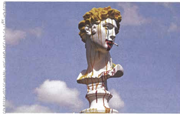
The Bruce High Quality Foundation's Self Portrait , 2011, at McClain Gallery

The installation in question, "Isles of the Dead," engages in a strange tête-à-tête across time with late-19th-century Swiss symbolist painter Arnold Böcklin , whose canvases of the same name, circa 1880 to 1886, emitted fin de siècle sensibility by alluding to Charon ferrying souls across the River Styx to a dark afterlife. The grand project staged at McClain samples from Warhol, Picasso and Velázquez, as well as the collective's own Böcklin-inspired Manhattan performance sailing the East River towards a garbage dump. Don't expect a congenial meet-and-greet with BHQF; the collective operates under cloak-and-dagger anonymity; see what we mean in our exclusive and highly enigmatic online Q&A coming next month. Catherine D. Ansporn