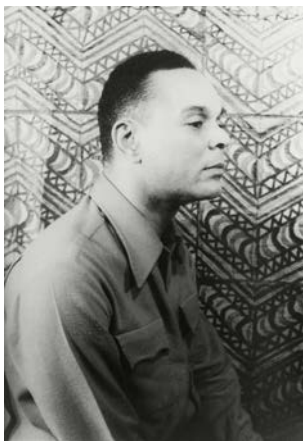
The writer Chester Himes, 1946.

S.: That takes an immense vulnerability because, like you said, when we all started to get noticed, we were just trying to tell our stories. I think of myself in the studio recently being like, "I just feel like doing this monochromatic blue painting." There's so much anxiety about doing that, and you just gotta say to yourself, "I'm going to be this spill, 25 I'm going to be this borderless representation of myself, this abstraction of myself." I want to keep spreading out and expanding — just be on your Ellsworth Kelly, go ahead, do your thing, it's enough.