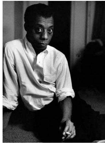
The writer James Baldwin, circa 1963.

So just keeping each other focused on artistic freedom, on play , and also recognizing that by making the work that our ancestors maybe didn't have the space or the funds or the peace or the community to create, that we're also starting a canon that's been sparse, that's been wiped out by H.I.V./AIDS. We're the first truly abundant moment of what's been a long canon, a canon that has all these silences within it. And how do we make sure that all these babies find themselves, that they're not coming up empty when they're looking for themselves in the libraries and on the screens and on the walls of these museums? We're making ourselves legible to them so that they know that they have a past; that they exist; and that they damn sure have a future.