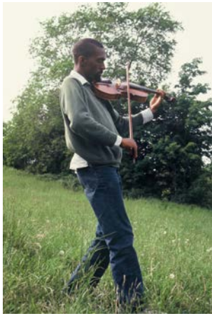
The composer and singer Julius Eastman playing the violin at Griffis Sculpture Park in East Otto, N.Y., during a 1975 rehearsal by the S.E.M. Ensemble.