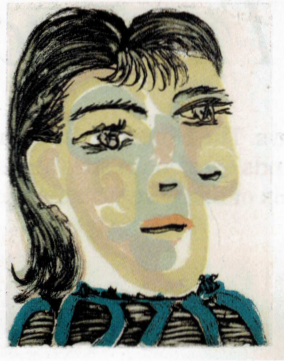
"TÊTE DE FEMME IV, PORTRAIT DE DORA MAAR," 1939