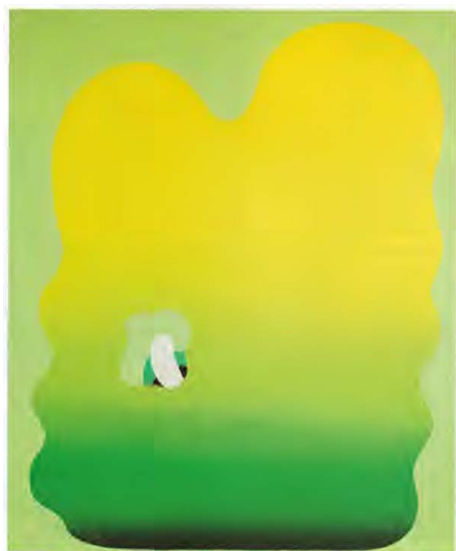
Alika Herreshoff: The Passenger , 2015, acrylic on canvas, 24 by 20 inches.