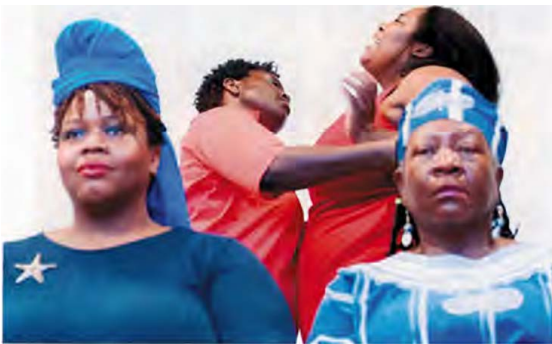
View of Autumn Knight's performance WALL at the Contemporary Arts Museum Houston, 2016.

into the performance area and force the performer to stop choking himself.