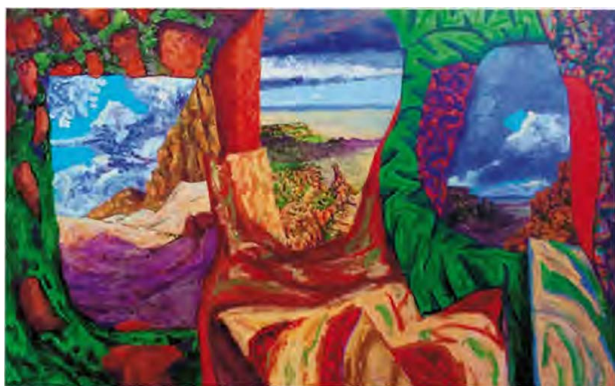
Earl Staley: Portal Series #19 , 2015, acrylic on canvas, 29 by 63 inches.