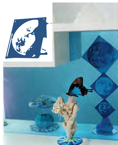
Dario Robleto: Harvest/Harvest Moon (detail) , 2014–15, cyanotypes of various moons in the solar system, crystals, paper, feathers, and mixed mediums, 30 by 69 by 16 inches overall.